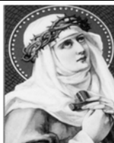
St. Catherine of Siena