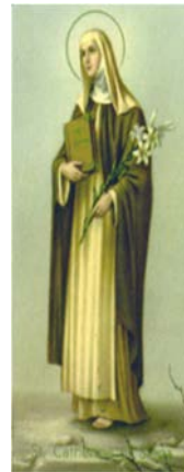
St. Catherine of Siena, Our Patroness, Pray for us.