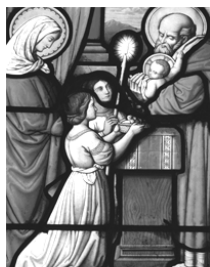
The Presentation at the Temple WORLD DAY FOR CONSECRATED LIFE

Pope John Paul II instituted a day of prayer for women and men in consecrated life. Like Christ who is the light of the world, so too, those in consecrated life are called to reflect light of Jesus Christ to all peoples. Those consecrated to God by the vows of chastity, poverty and obedience seek to live their Baptismal promises more intensely.